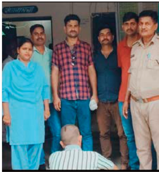
legal weapon was recovered with the swift action of the police officers.