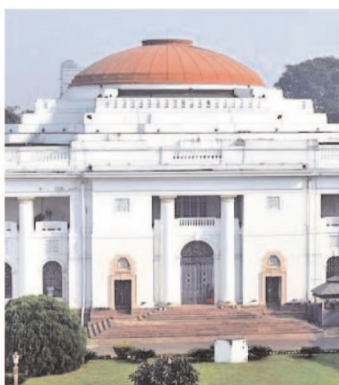
The West Bengal Legislative Assembly

On June 23, Adhikari had said his government has identified thousands of illegal immigrants and begun deporting them while assuring genuine Indian citizens they would not be affected, irrespective of their faith.