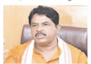
BJP leader R Ashoka

Questioning whether Shivakumar was hiding out of fear of coalition politics in Tamil Nadu, the Leader of Opposition in Karnataka Assembly challenged the CM to march to Chennai now and stage a hunger strike in front of the Tamil Nadu Congress office, if he had courage.