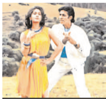
A still from Shahenshah

Taking to Instagram, Meenakshi posted her reel where she is seen recreating the song in a yellow outfit that she paired with blue accessories from the original song. In the caption, she explained the video is a tribute to her memorable yellow