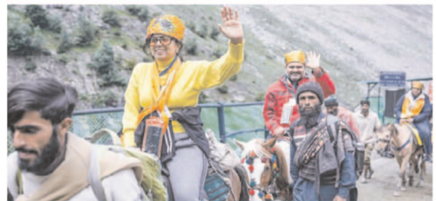
Amarnath Yatra pilgrims riding ponies wave as they proceed towards the holy cave shrine via the Baltal route in Ganderbal district of J&K

The atmosphere at the Bhagwati Nagar base camp was charged with devotion as pilgrims chanted "Bam Bam Bhole", "Har Har Mahadev"