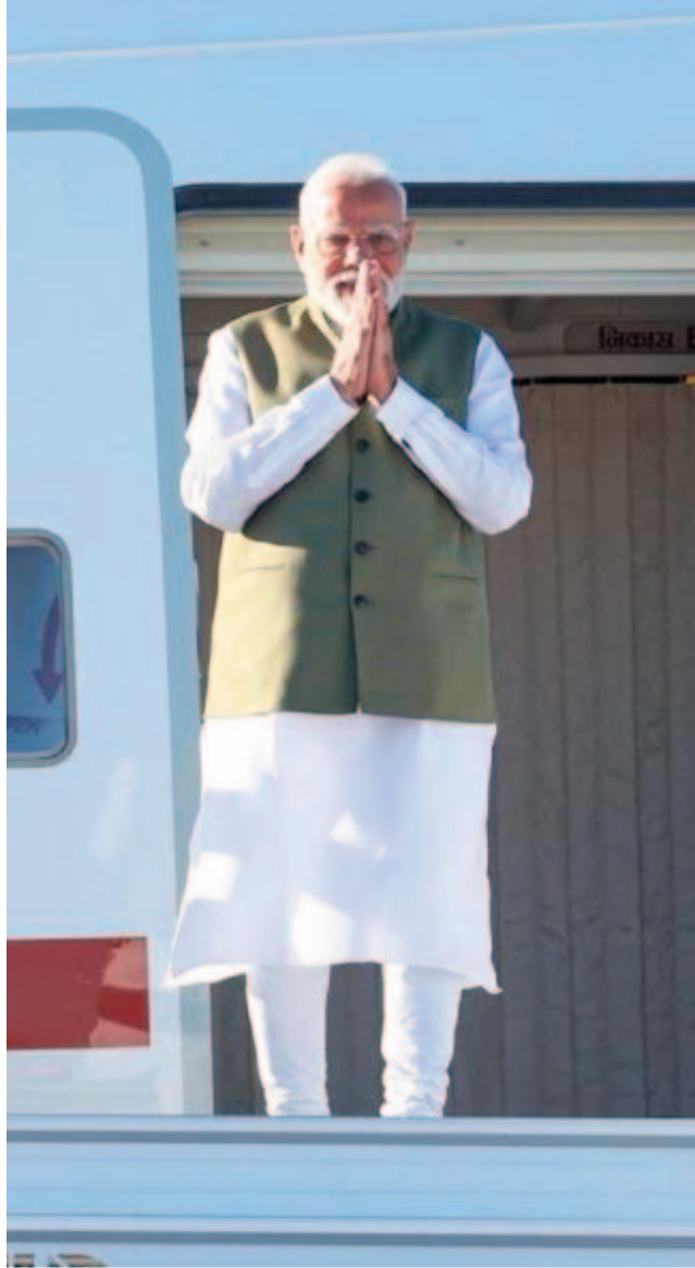
PM Modi Landed in Nice (France)