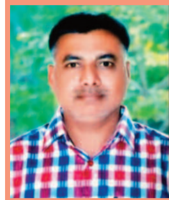
Dr. Rakkireddy Adireddy Kakatiya University

Global political instability is also closely tied to economic pressures. Rising unemployment, inflation, and inequality can lead to public anger, protests, and political unrest. History demonstrates that economic crises often reshape political systems and international relations. The world economy today appears to be entering a period of structural transformation. Digital technologies, green industries, artificial intelligence, cryptocurrency systems, and shifting trade alliances are changing the foundations of global economic power. The dominance of the U.S. dollar is increasingly being questioned, while countries such as China and BRICS nations are exploring alternative payment systems and trade arrangements. Ultimately, the 2026–2027 period may not simply represent another economic slowdown. It could become a defining phase that reshapes the future structure of the global economy itself. The countries that succeed will likely be those that invest in technology, strengthen energy and food security, improve education and employment systems, and reduce economic inequality through balanced policies. The warnings being discussed today should not merely create fear. Instead, they should encourage governments, businesses, and societies to prepare for the changing realities of the future global economy.