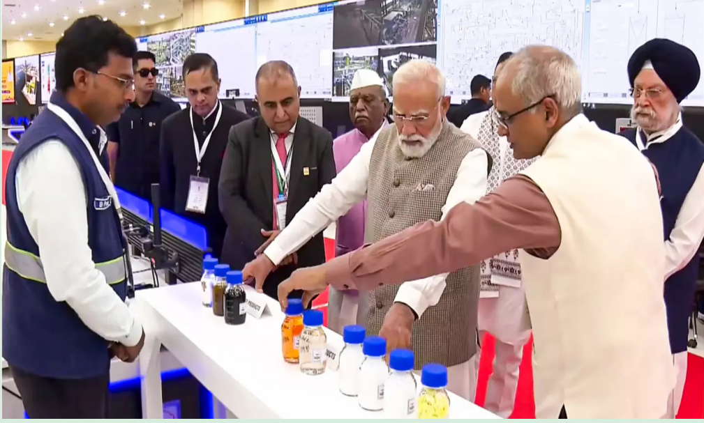
Prime Minister Narendra Modi, Rajasthan Governor Haribhau Bagde, Union Minister for Petroleum and Natural Gas, Chief Minister Bhajanlal Sharma and others during the inauguration of the Pachpadra refinery site, in Balotra