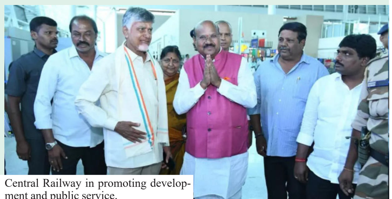
Central Railway in promoting development and public service.