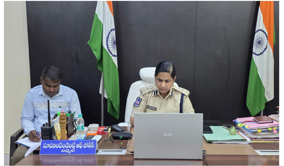
plays a vital role in addressing the problems of the public and stressed that all officers should work in coordination to provide efficient and citizen-friendly services.