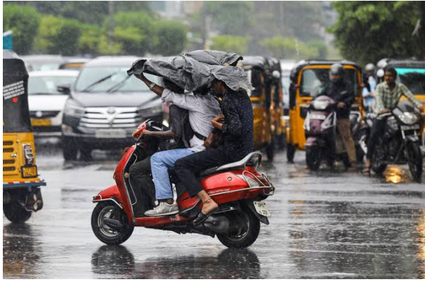
Yadadri Bhuvanagiri districts.

The rainfall activity is likely to continue on Thursday as well. Orange Alerts have been issued for the erstwhile Adilabad and Karimnagar districts, along with Nalgonda, Suryapet, Mahabubabad, Warangal, Hanamkonda, and Nizamabad. Yellow Alerts will remain in effect for Khammam, Bhadradi Kothagudem, Rangareddy, Hyderabad, Medak, Mulugu, Jayashankar Bhupalpally, Jangaon, Siddipet, and